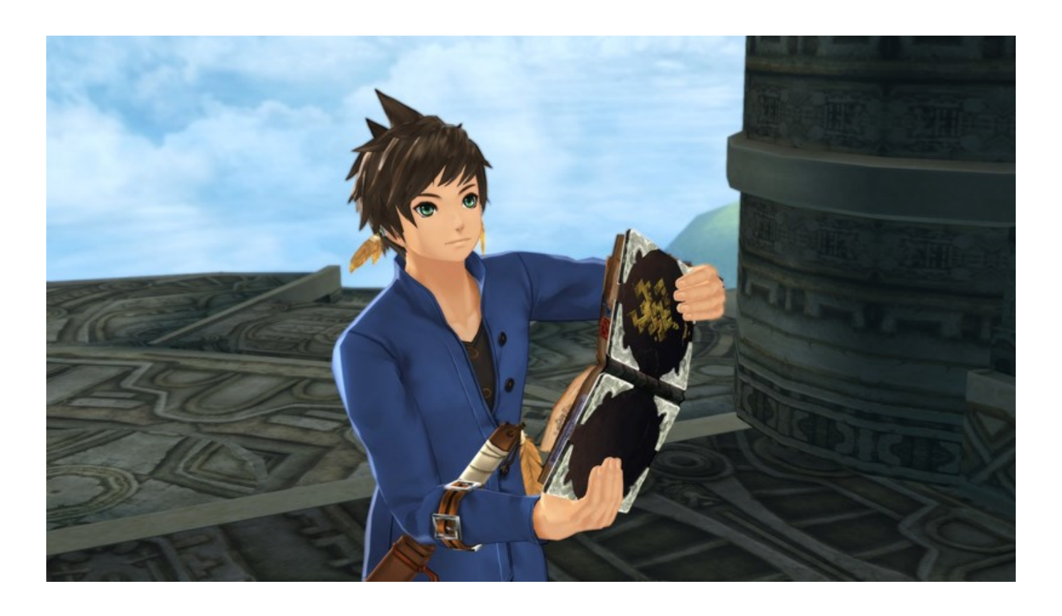
Tales Of Zestiria - Adventure Items Crack 64 Bit

Download ->>->> <a href="http://bit.ly/2SIDe0y">http://bit.ly/2SIDe0y</a>